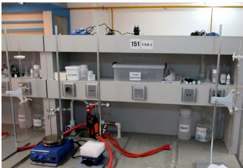
Working place at the practical exam